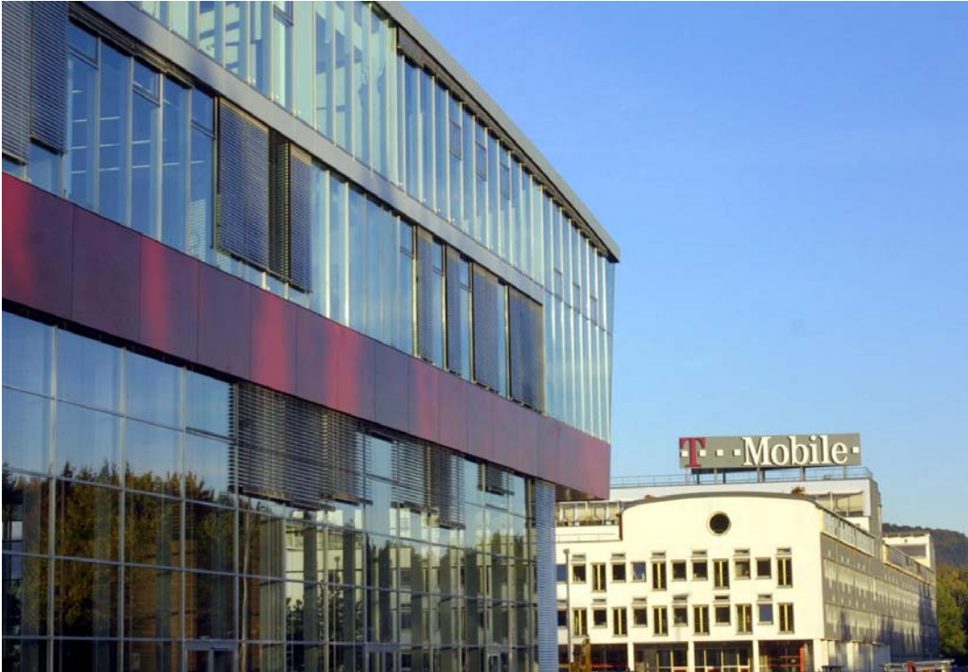
T-Mobile Campus in Bonn, Germany